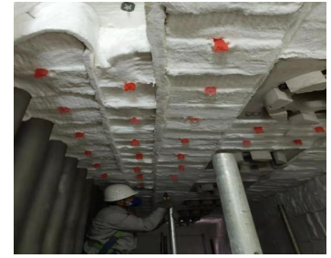
Installation of Pyro-Bloc on ceiling