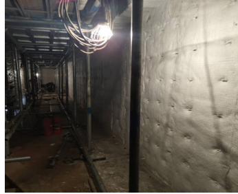
Completed backing blanket