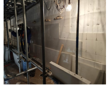
Completed backing plate