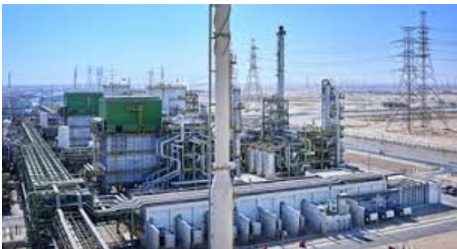
Typical hydrogen plant