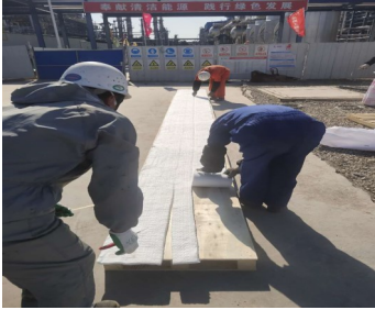
Laying of backing blanket