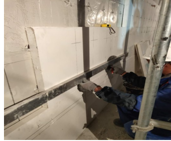
Laying of backing plate